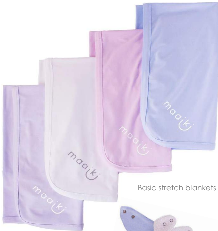
Basic stretch blankets